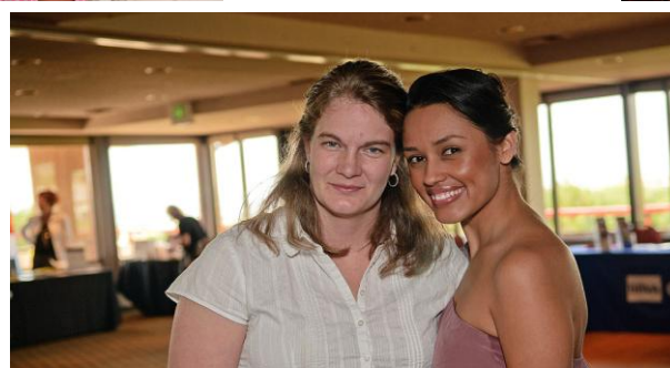
Little Beauty on the Go!